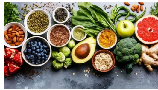
Food IS medicine!

We all age, and with time levels of our hormones naturally wane, leaving especially women to suffer horrendous symptoms related to perimenopause and beyond. The goal is to replace what nature and time have lost and restore equilibrium, so women and men can easily navigate menopause and andropause, without feeling like aliens in their own body.