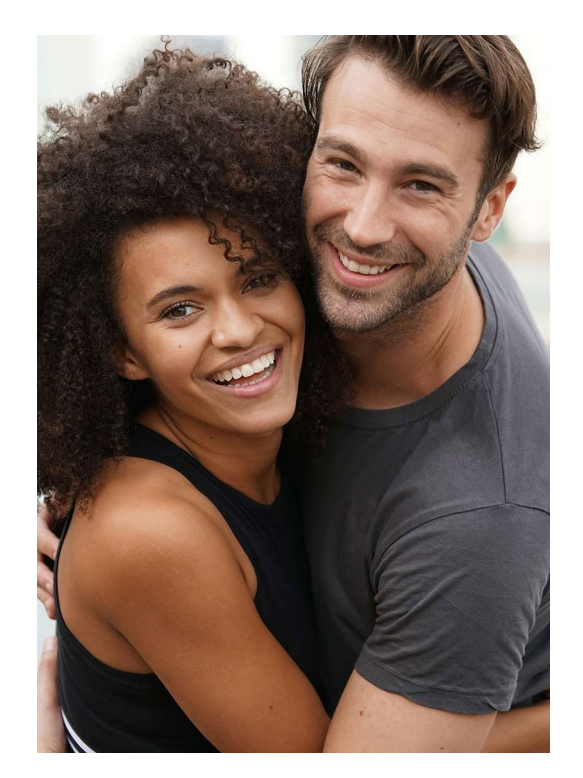
BHRT and Functional Medicine applies to both women and men!

You don't have to suffer in silence anymore! Your symptoms are not "in your head," they are real symptoms reflecting the declining levels of your hormones, or hormonal imbalance resulting from poor diet, exposure to environmental toxins and endocrine disruptors, medication side-effects or gut dysbiosis. You too can age gracefully, feeling great and benefiting from the protecting effects of bioidentical hormone replacement!