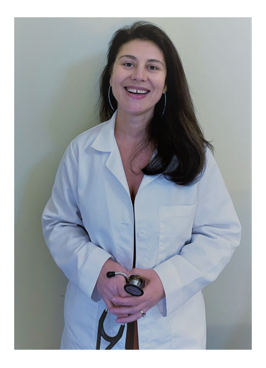
My aim is to work with your PCP and GYN to help you restore your hormonal balance naturally!

www.truehealthsolutionsclinic.com dr.elena@truehealthsolutionsclinic.com